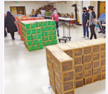
Nishi Girl Scout parents organize the Girl Scout cookie shipment