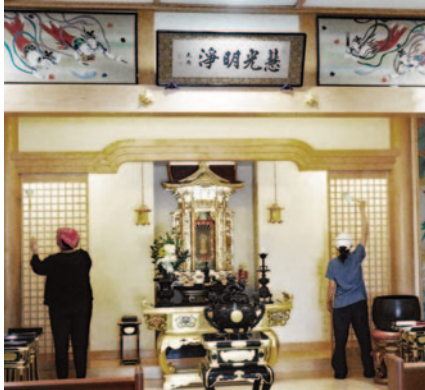
Year-end cleaning of the Wisteria Chapel