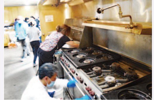
Year-end cleaning of the well-used kitchen