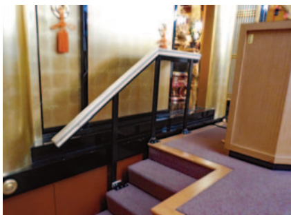
Newly installed handrail to ensure safe descent from the onaijin