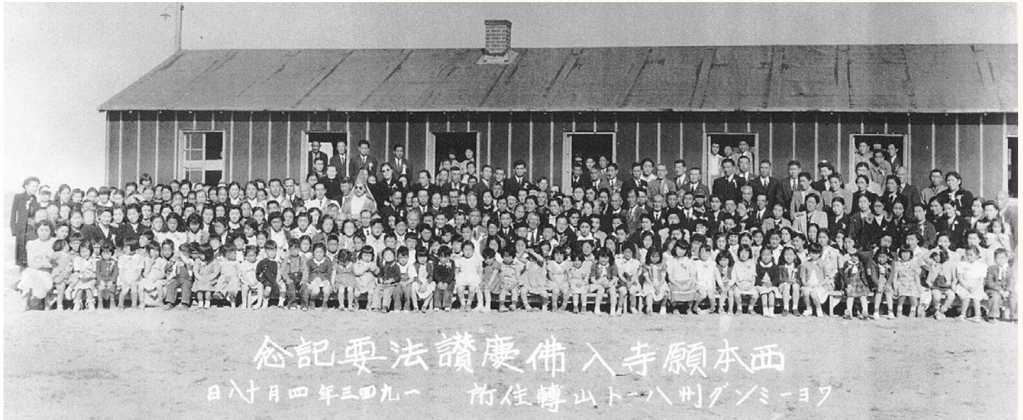
April 18, 1943 Nyubutsu Keisan Hoyo Kinen,

Dedication of Nishi Hongwanji Buddhist Temple commemorative service, Heart Mountain, Wyoming, Relocation Center