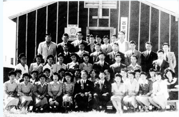
Heart Mountain Sunday School Teachers 1943