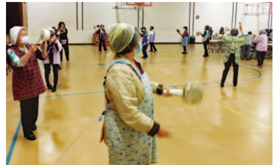
BWA, wearing their “uniform” and holding their “tools” dance “Kitchin Ondo” at the Oseibo program.