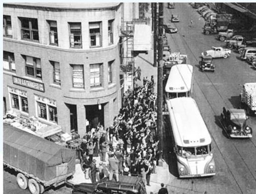
1942, First Street and Central Avenue, 119 North Central Avenue, Nishi Hongwanji Temple, meeting/loading area for transport to assembly centers.

The Nishi Hongwanji Family #18390, consisting of 42 members, departed for Santa Anita Assembly Center, Arcadia (Santa Anita Race Track) on 9 May 1942.