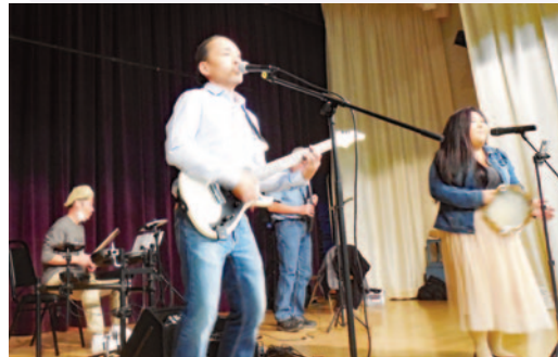
ABASonics entertain the Oseibo luncheon attendees.