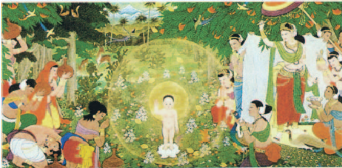
“Birth” in Lumbini Garden

— Mural “Life of Shakyamuni Buddha” LA Betsuin Hondo