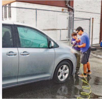
Year-end washing of the temple van