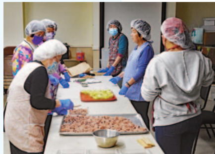
BWA is making sekihan for the Ho-onko observance because it is purported that Shinran Shonin had a penchant for this rice dish.