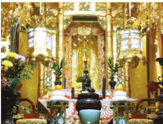
Okasane mochi placed in the onaijin for Gantan-e/Shusho-e, the New Year's Day Service.