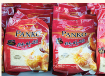
Panko gratis courtesy of Upper Crust Enterprises.