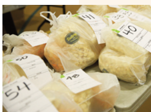
Popcorn orders ready to go.