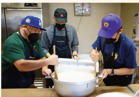
The "Gohan Guys"