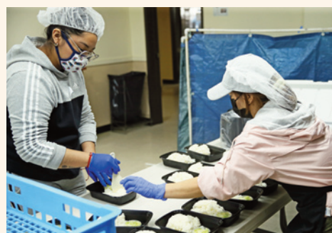
Arranging the gohan into plates...