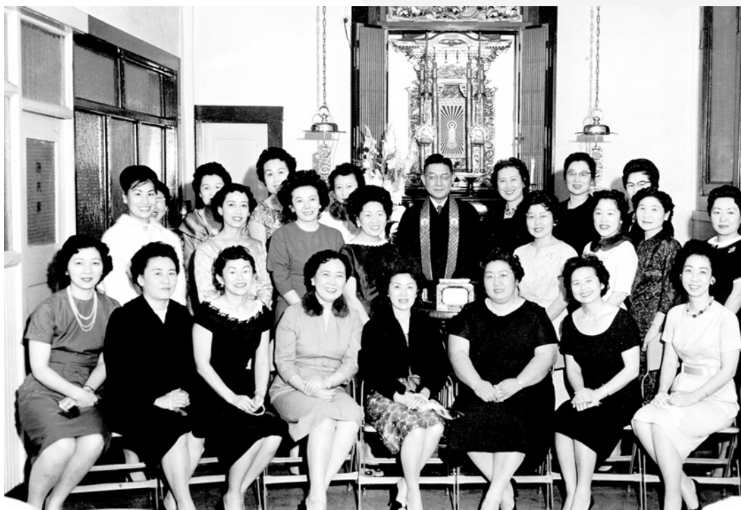
JR. MATRONS IN DOWNSTAIRS CHAPEL AT CENTRAL AVENUE SITE 1957