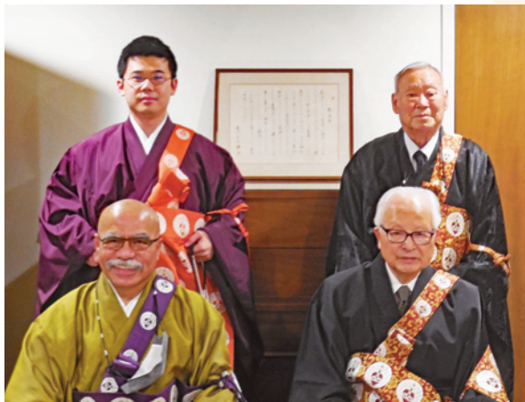
Ohigan Service Ministers