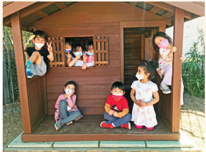
Nishi Center students pose in the playground play house repaired by temple members.