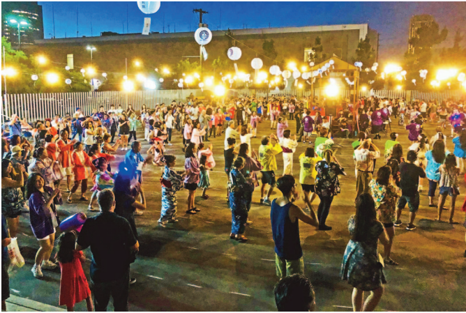
Los Angeles Betsuin Bon Odori 2019

https://www.buddhistchurchesofamerica.org/obon-gathering-of-joy