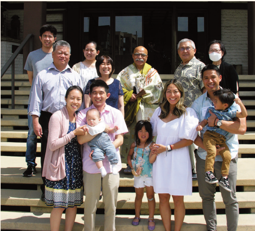
Hatsumairi Participants Kawasaki families on the left. Han/Kakita families on the right.