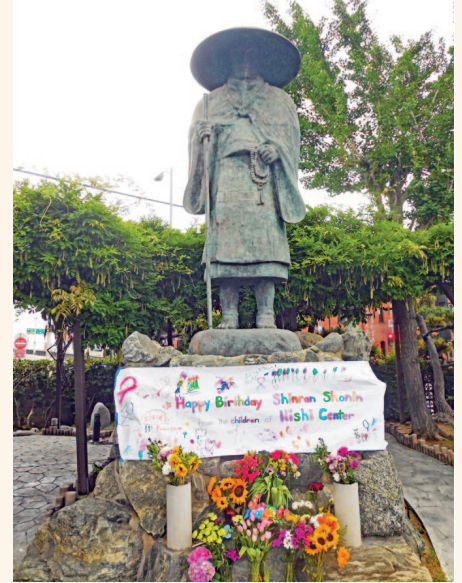
Nishi Center Gotan-E Nishi Center students create a Happy Birthday banner for the birth of Shinran Shonin. They had a service by the statue and presented flowers.