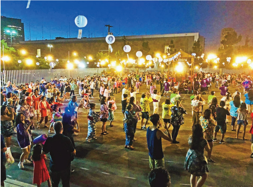
Joyous dancers during the balmy Summer evening under the lights of the memorial chochin.