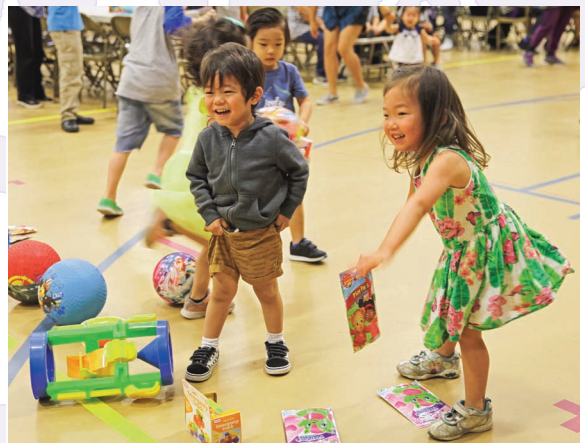
Family Fun Day - Happy preschool-aged children and their game prizes.