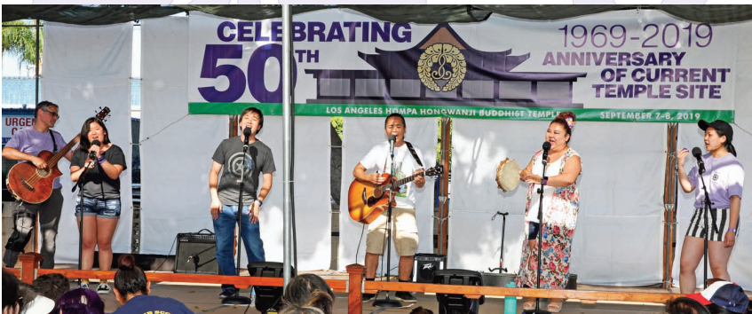
The Betsuin's new singing band – ABAsonics