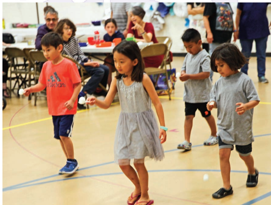
Family Fun Day Kindergarten students trying their best to keep their ping pong ball in their spoons