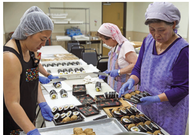
Packing futomaki and inarizushi made from scratch by the Betsuin BWA.