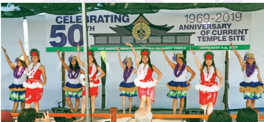
Ho'Aloha Polynesian Dancers