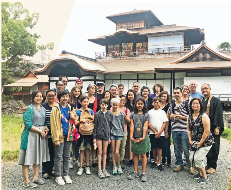
Tour members in front of the Hiunkaku Pavillion on the Nishi Hongwanji

The hostel Tokyo 2020 House served as our home sleeping base. It had been recently renovated, and was Japan-