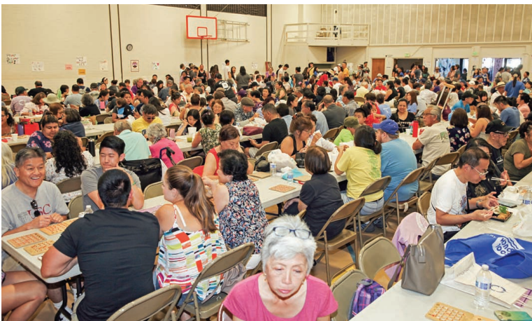
Dining and BINGO in the Kaikan