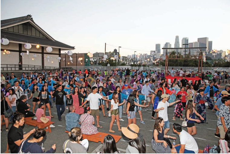
Bon odori at dusk with the Los Angeles downtown skyline in the background