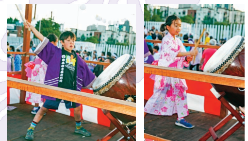
Youngest bon daiko players in training