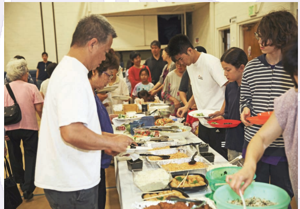
Family Fun Day pot luck food line