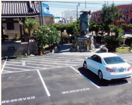
Two of the three Betsuin parking lots have been resurfaced and the parking spaces have been repainted.