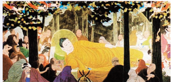
The Passing of Sakyamuni Buddha mural painting in the Betsuin hondo