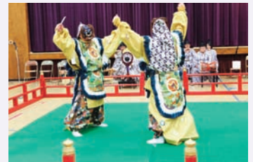
Bugaku "Nasori" by two male dancers.