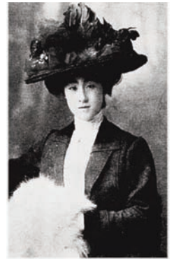
Lady Takeko Kujo