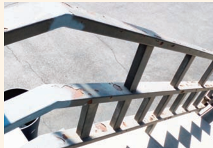
The previously chipped and rusted iron handrails (as seen above) were repaired.