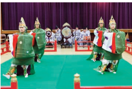
Bugaku "Engiraku" by four female dancers.