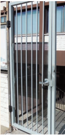
A new gate has been installed by the kitchen door to increase the security of the temple.

The next major project on the list is to replace the heating-ventilation-air conditioning system in the main building. This project cannot start until the funds are available to proceed. The estimated cost is $650,000.00 to $1.2 million depending on the system that is selected. Hopefully this project can be completed by the 2019 celebration.