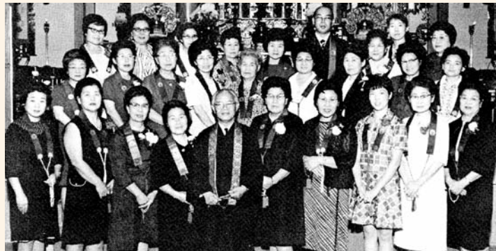
1971 BWA Cabinet