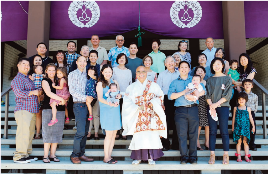
Hatsumairi participants and their extended families.