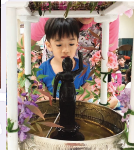
Nishi Center Hanamatsuri - pouring sweet tea over the Baby Buddha