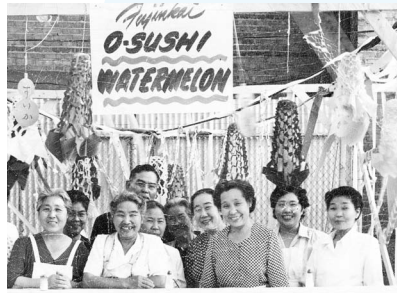
Obon 1940 Fujinkai

Nishi Hongwanji Fujinkai reported the ladies will have sushi, soda pop, and watermelon on sale.