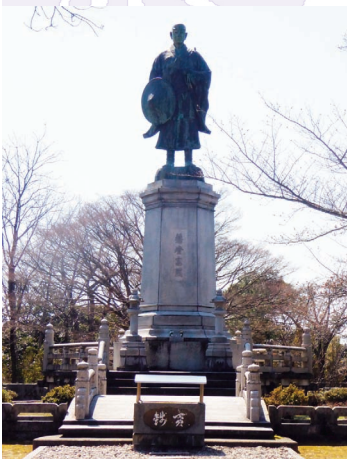
This statue marks the site where Shinran Shonin passed away which is the present site of Suminobo Hongwanji.