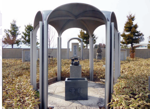
"Eshin No Sato," the gravesite of Lady Eshinni, Shinran Shonin's wife.