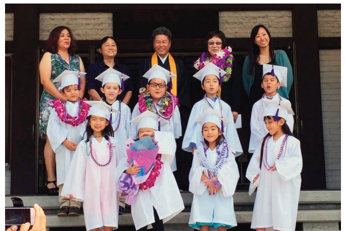
Nishi Center kindergarten graduates 2017