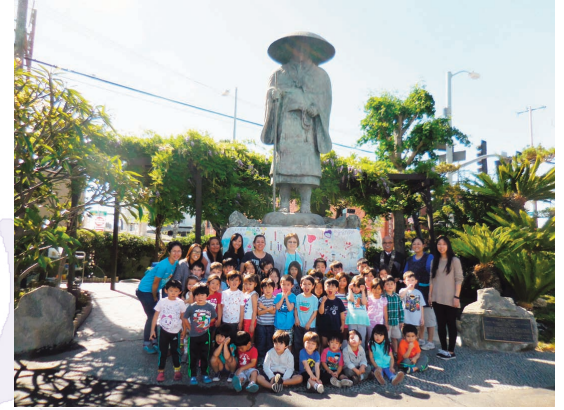
Nishi Center Gotan-ye