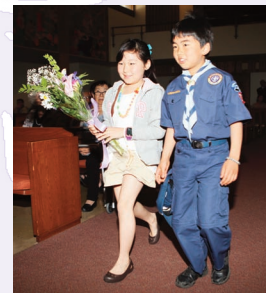
Betsuin Hanamatsuri service flower and sweet tea representatives