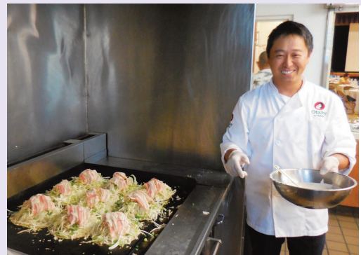
Otafuku brand chef prepared the okonomiyaki in the kaikan kitchen.