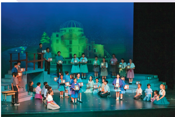
“Peace on Your Wings” stage scene

The performance showcased the many talented young cast members. The stage setting was simple and basic that served many scenes with added or subtracted stage props done by the cast members themselves. The heartfelt story of Sadako was interspersed with music and the beautiful voices were outstanding. The afternoon 2-1/2 hour musical ended with a standing ovation for the performers.