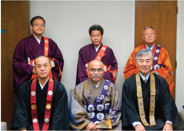
FALL OHIGAN MINISTERS