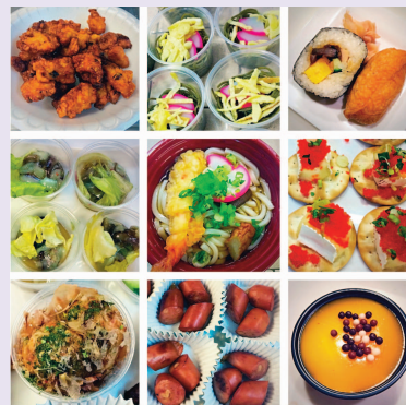
Food pairings... including dessert.