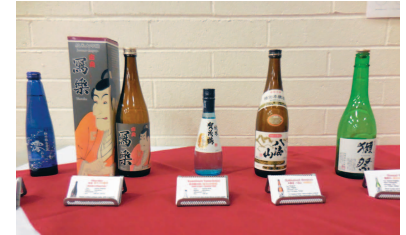
Some of the sake varieties tried by the sake tasters.