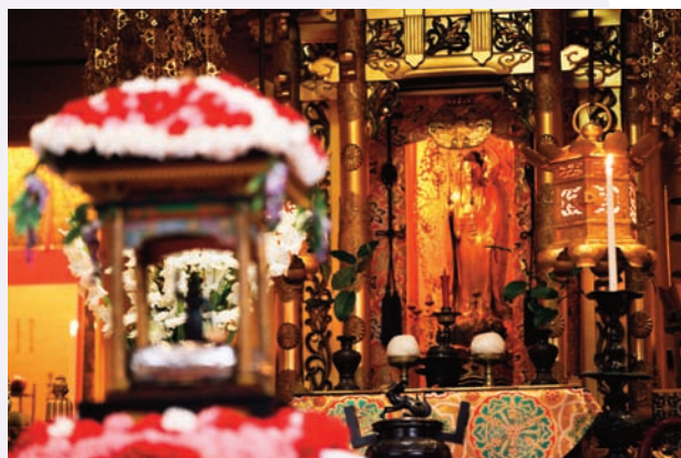
The statue of the Amida Buddha looking over at the statue of the baby Shakyamuni Buddha