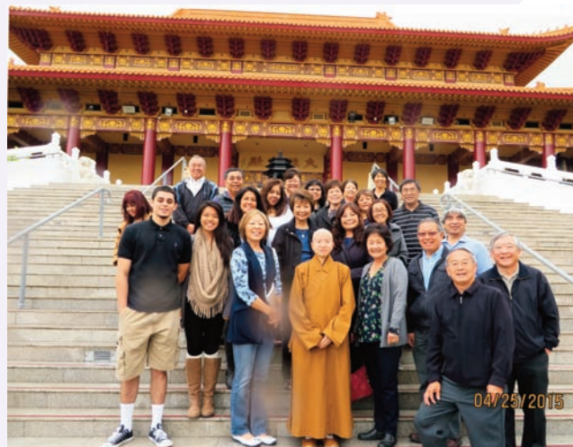
ABA members pose on the steps of the Hsi Lai Temple

ABA members walked away with a warm feeling of hope. A sense that mutual goals of different cultures, together can successfully fuse the teaching of Buddhism throughout the world .