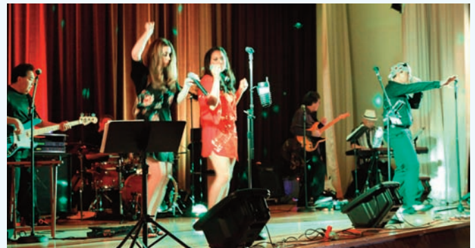
The Kokoro Band provided the music