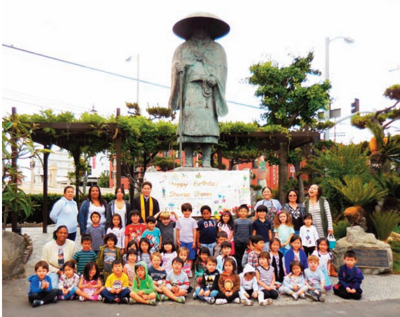
Nishi Center children observe Shinran Shonin's birthday by presenting flowers and singing Happy Birthday.