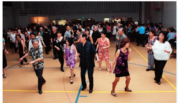
Learning a new dance...