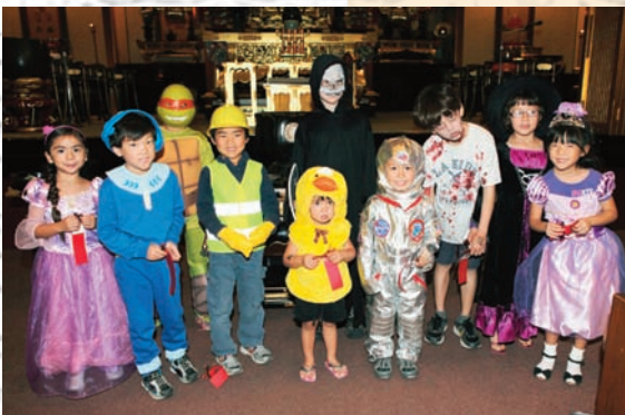
Dharma school children in costume.