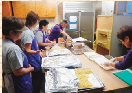
(left) ABA members prepare spaghetti for the Spaghetti Dinner fundraiser for the Betsuin's 50th Anniversary. (right) ABA men serve breakfast at the BEC sponsored Sunday breakfast.