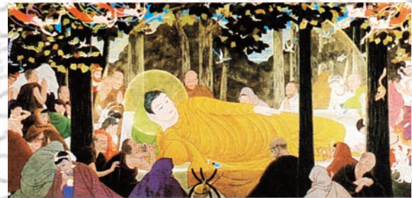
The Passing of Sakyamuni Buddha mural painting in the Betsuin hondo

Also, in Shoshinge "Hymn of True Shinjin and the Nembutsu," Shinran Shonin expressed his deep gratitude and his strong conviction to Sakyamuni Buddha as follows: