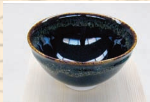
The BWA received this tea cup from Honzan (Mother Temple in Kyoto) in return for a donation sent for the ascension of the new Gomonshu. This is a tea ceremony "tea cup" that was created by a Japanese ceramist.