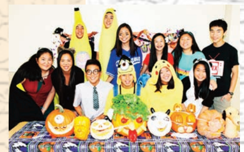
Jr Y kids had games for the little ones at the Halloween party.