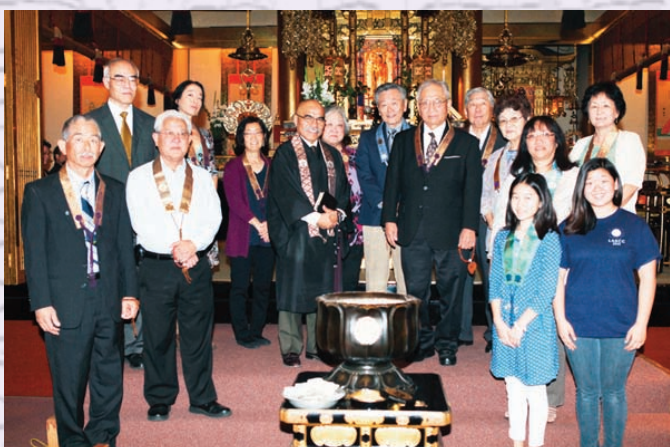
Newly Installed Officers of the Betsuin's Organizations