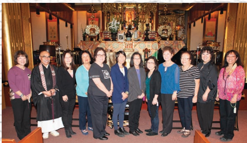
New BWA Members

For the future, the Betsuin's BWA will begin planning for the celebration of its centennial in 2018.