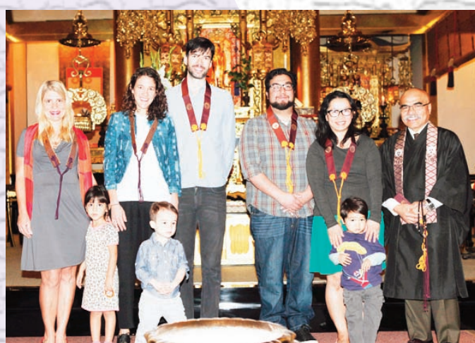
New Betsuin Members