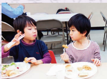
Family Pot Luck