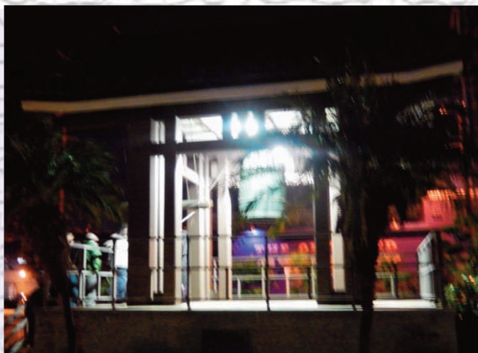
Following the New Year's Eve service (Joya-e), the service attendees had the opportunity to toll the bonsho (large bell).