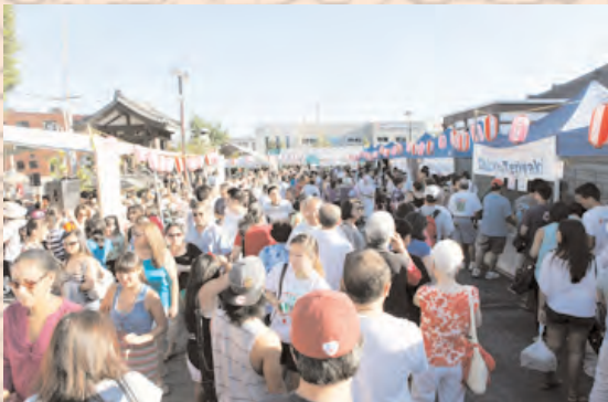
Wall to wall people in the carnival area buying food, plants, produce and playing games.