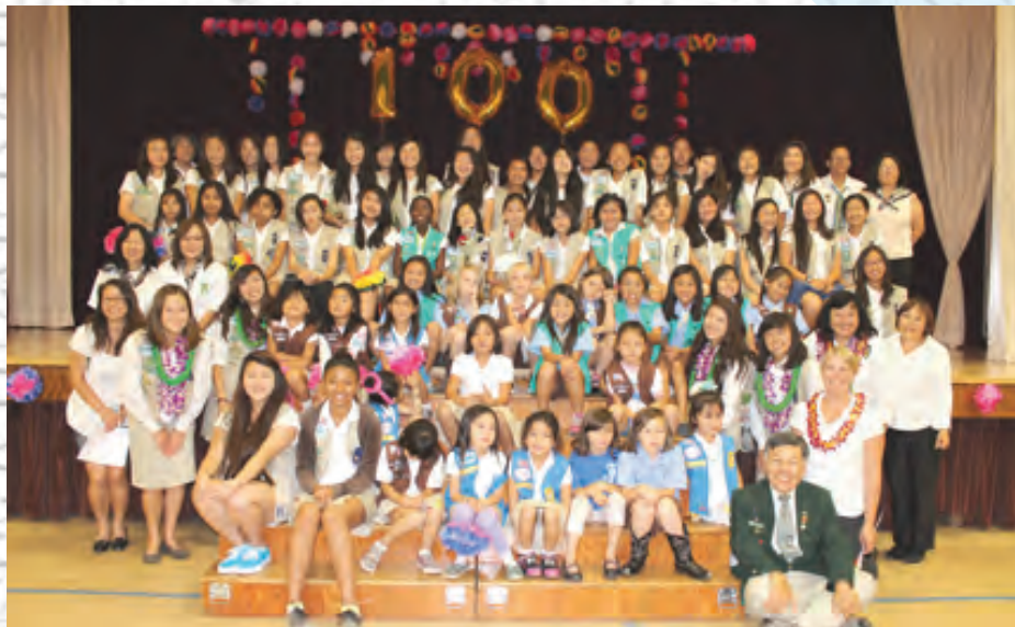
Betsuin Girl Scout Troop 1213 Court of Awards