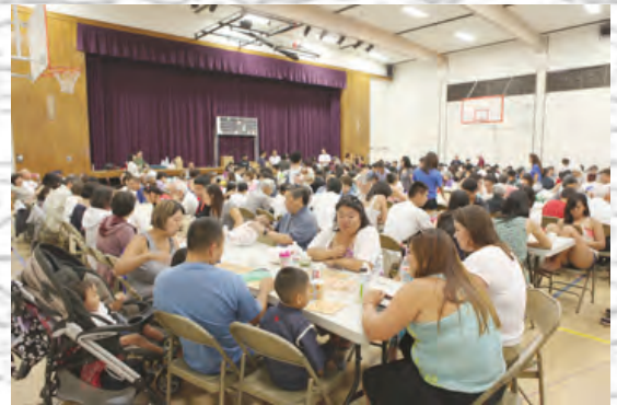
Wall to wall people in the kaikan eating udon and playing BINGO.