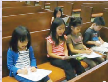
Nishi Center students chanting Juseige

“ Kyo ” means sutra in Japanese, so people sometimes ask me “ Is there Eitai-Sutra? What kind of sutra is it? ” I can say there is no such sutra.