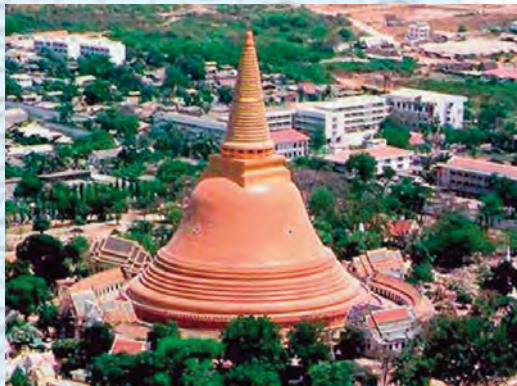
Phra Pathom Chedi