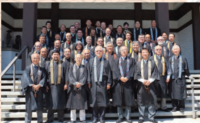
BCA ministers attend the annual Summer Fuken hosted by the Southern District Ministers in Little Tokyo.

On the last day of the Fuken we held our closing service at the Miyako Inn banquet room. During the closing serv-