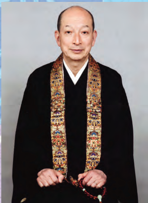
GOMONSHU KOSHIN OHTANI

Reciting the Nembutsu, we welcome the new year. I express my warmest greetings to you. Following the East Japan Great Earthquake, one year and ten months has passed. More than a hundred thousand people continue to live in evacuation center housing, unable to return to their homes. Personally, I find the events of the Seven Hundred Fiftieth Memorial for Shinran Shonin and East Japan Great Earthquake to be inseparable.