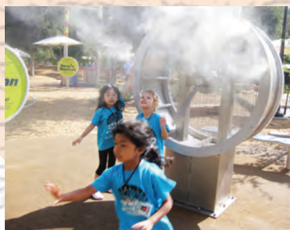
Nishi Center students explore the Fan Mist in the Physics Forest at the Kidspace Children's Museum.