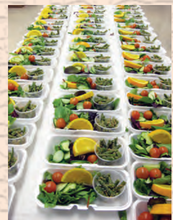
Surf and Turf veggies all packed and ready to go. (see page 10)