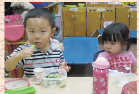
Two three-year olds who have adjusted to Nishi Center-life having lunch.