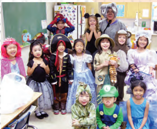
Nishi Center kindergartners pose in their costumes.