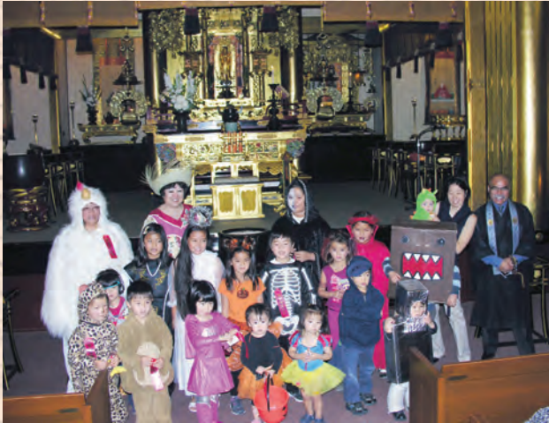
The dharma school students (plus others) pose in their Halloween costumes.