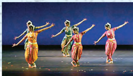
Arpana Dance Dance Company