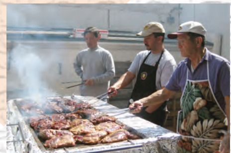
M-m-m-m....beef! (additional photo on page 13)

Hundreds came to enjoy their Surf & Turf dinner, play some rounds of BINGO, and get hold of some wonderful items through the Silent Auction .... a great evening out!